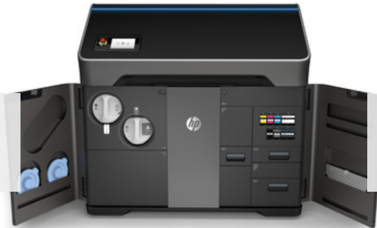
Image shows the HP Jet Fusion 580 Color 3D Printing Solution

HP Jet Fusion 540/340 3D Printers 4-agent configurability