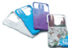
Data courtesy of FreshFiber